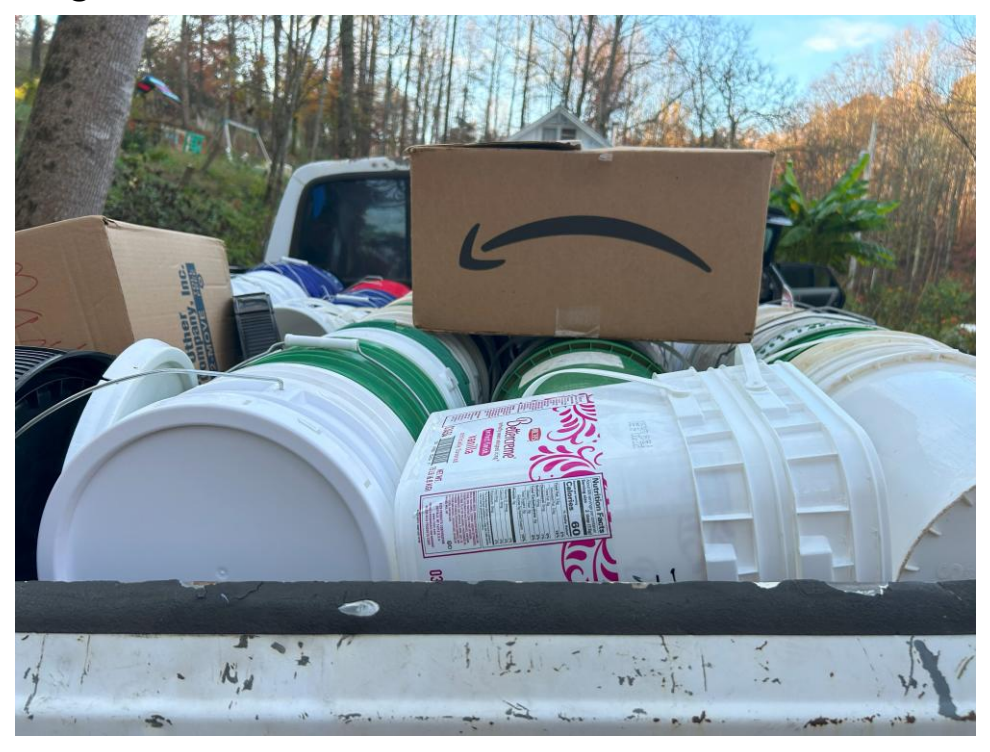
PI's pick up full of buckets and filters & other aid