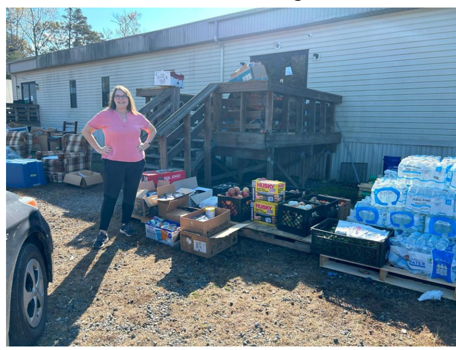
Church of God staging area for assistance to be brought to Spruce Pine