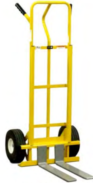
This hand truck from HandTrucksRus.com would move whole hives.