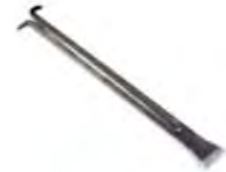
14 inch Giant Hive Tool

https://www.betterbee.com/beekeepers-tools-and-smokers/beekeeping-tools.asp $12