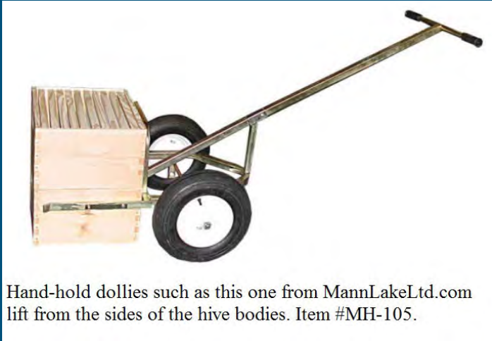
Hand-held dollies such as this one from MannLakeLtd.com lift from the sides of the hive bodies. Item #MH-105.