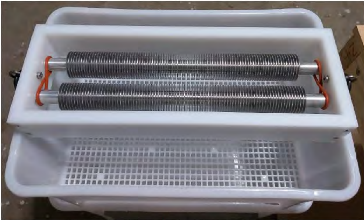
The double roller uncapper setup in a mesh-based tub