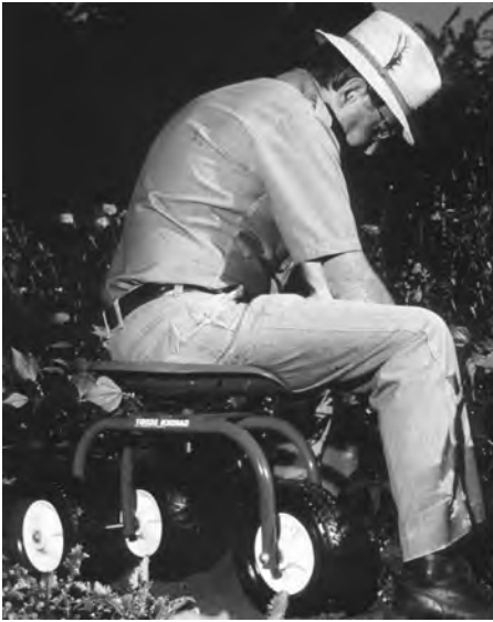
Master Manufacturing Co.