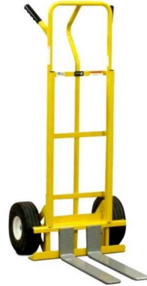
This hand truck from HandTrucksRus.com would move whole hives.