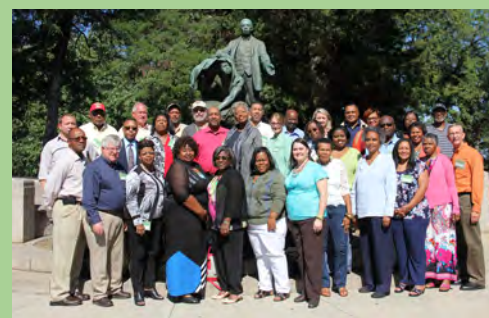
Participants at AgrAbility Tuskegee Workshop

and Tuskegee University. In addition, NAP participated in conferences targeted to black farmers, and several 1890 staff members and