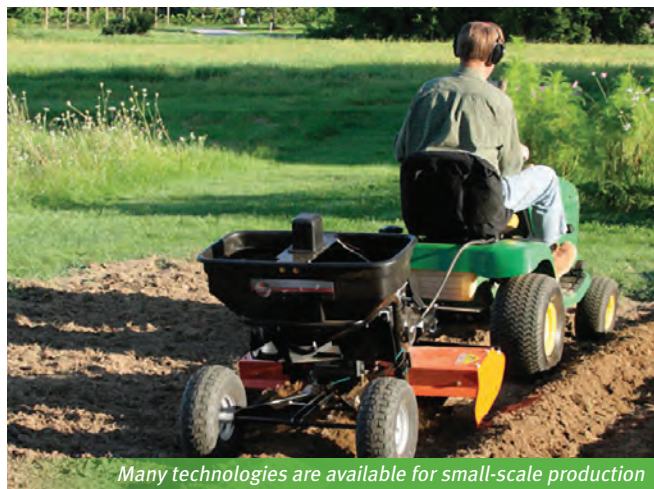
Many technologies are available for small-scale production

While the focus often seems to be on raising fresh fruits and vegetables, other opportunities abound. Small-scale livestock production, like chickens, goats, and rabbits, are popular. Aquaculture (fish farming), hydroponics (growing produce without soil), and aquaponics (raising fish and produce in