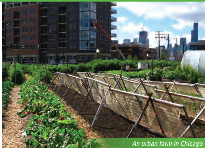
An urban farm in Chicago

Small-scale agriculture, on the other hand, can make starting a farm-related career more affordable. While there are a multitude of factors that influence costs, some small-scale agriculturalists begin with just a few acres. And the option of urban agriculture