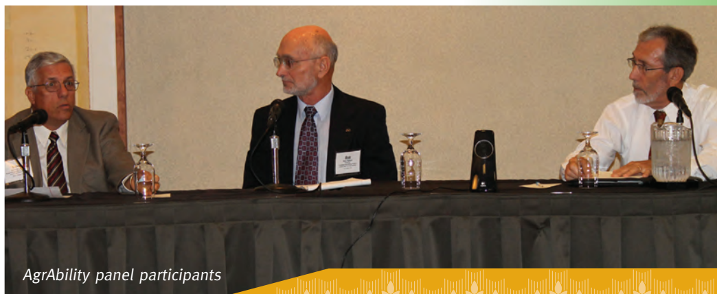
AgrAbility panel participants