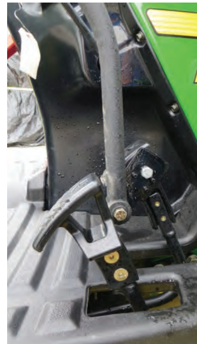
Figure 3. Hand control mounted to hydrostatic transmission control pedal. Factory-linkage allows for a single hand control lever to actuate both the forward and reverse pedals.