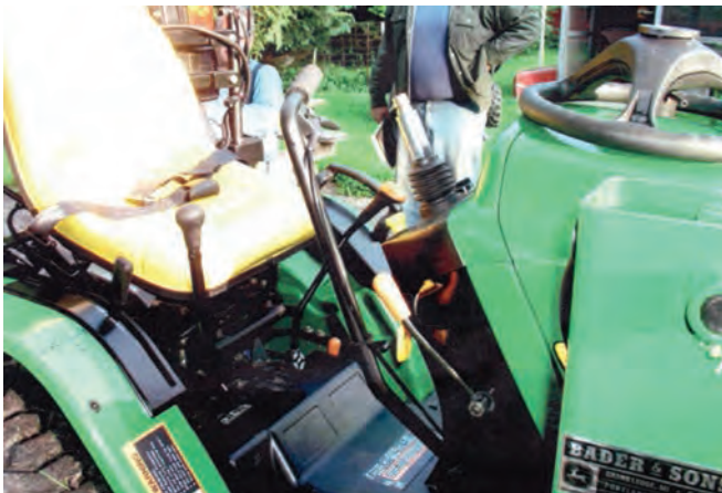
Figure 9. Locking hand control lever with removable steering wheel for easier mounting/dismounting of the machine.