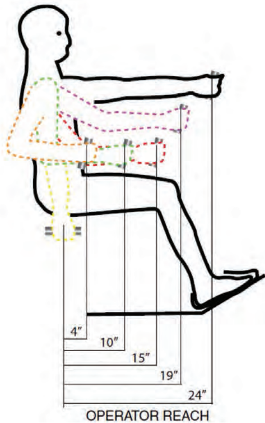
Figure 6. Frequently used controls need to be placed such that the operator can reach/use them without undue exertion or fatigue.