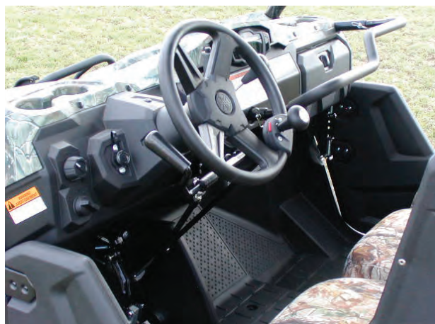
Figure 4. Modified UTV foot controls using horizontal lever connected to the pedals with adjustable mechanical linkages.

There is a wide range of driving aids developed for the motor vehicle industry with high-tech electronic controls, such as: push-pull braking, acceleration and electronic driving systems, and acceleration, braking and steering with sophisticated drive-by-wire systems. In only a few cases have these systems been applied to agricultural equipment.