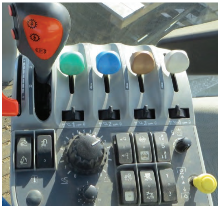
Figure 11. Color coding for operator controls.

Visual identification of controls can reduce the risk of error during the machine's operation. This may be important not only for the operator, but also for others nearby who could be injured by inadvertent actuation of the machine or any attachments. Two types of visual identification discussed here—color coding and labeling.