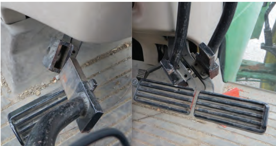
Figure 2. Removable pedal extensions constructed of barstock, clamped to the pedal with above platform pedal pivot.