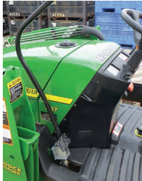
Figure 1. Lever extension bolted to clutch pedal.

Lever extensions are usually constructed of either flat-bar steel, steel tubing, or steel rods that are clamped, bolted, or welded to the factory control. Clamped or bolted assemblies with brackets that allow the extension to be easily removed are preferred because they provide the greatest measure of accommodation for users with and without impairments. Although they're simple and low-cost, sometimes it's not possible to gain sufficient leverage with only a lever extension. They may require excessive force to operate the control, which may, in turn, increase the risk of secondary injury. Cases have been noted in which the excessive force required to activate hand controls has resulted in shoulder injuries due to repetitive use, or in more severe cases, the loss of control of the machine. Figures 1, 2, and 3 show lever extensions either clamped or bolted onto a clutch pedal, brake pedals, and a pedal-controlled hydrostat transmission, respectively. Quick-attach style of lever extensions (not shown) can be used on older types of foot-operated pedals without the use of clamps or bolts. However, they only function with pull force, as a push force will dismount the lever from the pedal (thus, the pedal pivot point must be above the operator station platform).