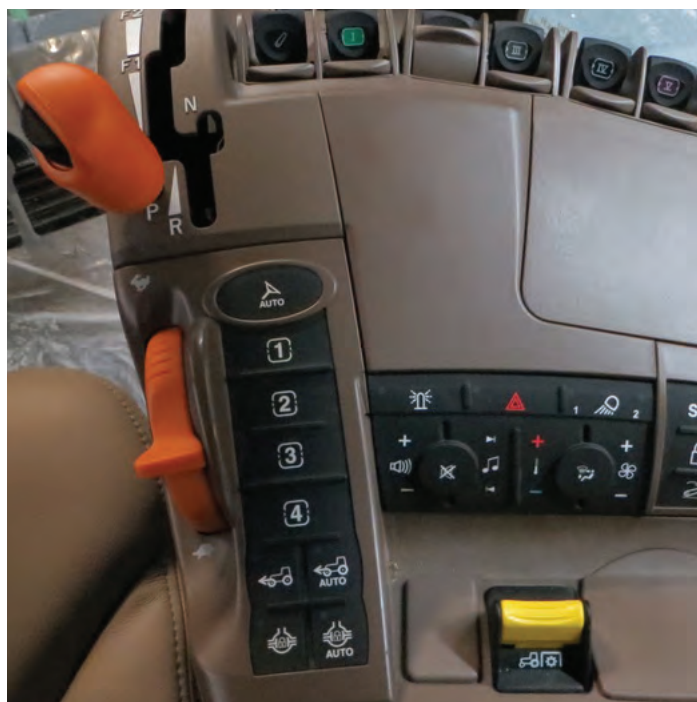
Figure 12. Graphical symbols for operator controls.

Standard ANSI/ASABE AD11684, “Tractors. Machinery for Agriculture and Forestry, Powered Lawn and Garden Equipment: Safety Signs and Hazard Pictorials: General Principles” sets out the requirements for legibility, as well as the use of standardized graphical representations of control function with clear large text (ASABE, 2011). Graphical symbols should be designed with clear color patterns/symbols to transmit information independently of language, which is helpful to