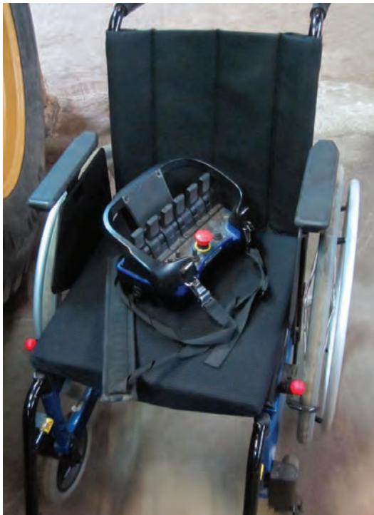
Figure 5: Wireless controller allows operator to control machinery from remote location without repositioning from one machine to another.