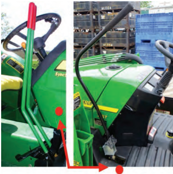
Figure 7. (Left) Pedal pivot point above platform floor requires pulling action to manipulate the pedals, (Right) Pedal pivot point below platform floor requires pushing action to manipulate the pedal.

will be based on the pedals' pivot points. Figure 7 shows a pair of hand-control levers attached to brake pedals with above-platform-floor pivot points; this configuration requires the operator to pull the levers toward his body to apply braking forces. Figure 7 also shows a single hand-control lever mounted to a clutch pedal with a below-platform-floor pivot point; this configuration requires the operator to push the lever forward away from his body in order to disengage the clutch.