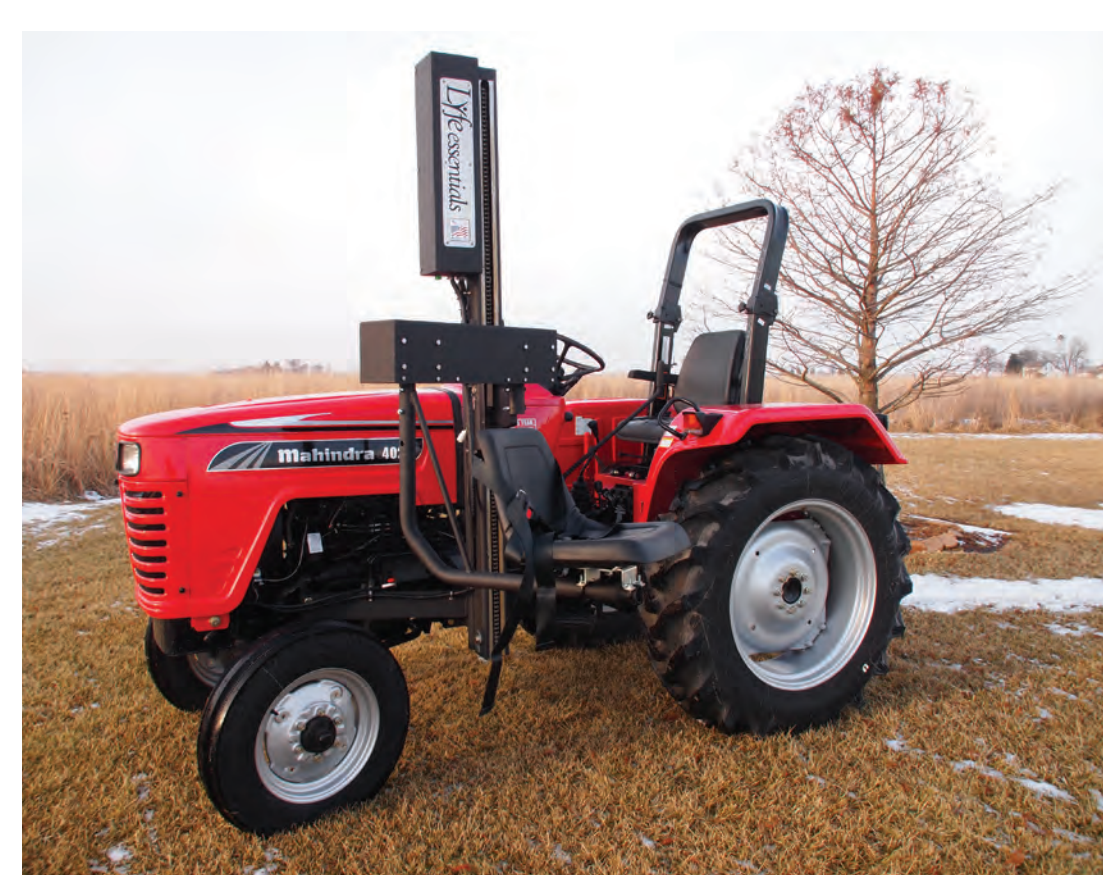
Figure 6. Chair lift mounted to vertical mast.

avoid uneven ground or field crop residue during equipment operation yet can allow the seat to be lowered to a position that allows easy transfer to or from a wheelchair.