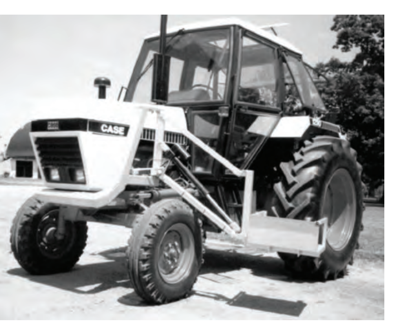
Figure 1. 1980's access lift concept, BNG Mark II man-lift.

On early access lifts, the user-lift interface was designed to meet the needs of the specific operator with a disability (Figure 1). Therefore, little or no effort was made to standardize either the lift components or the methods of transfer. For example, while a wheelchair-accommodating platform lift would elevate one in their chair to the level of the operator station, it did not move him/her within easy reach of the operator seat. This created a lengthy and awkward transfer, which increased the likelihood of a fall or overexertion. However, despite the negatives of this design, it did allow for the chair to be transported and be available wherever the machine went.