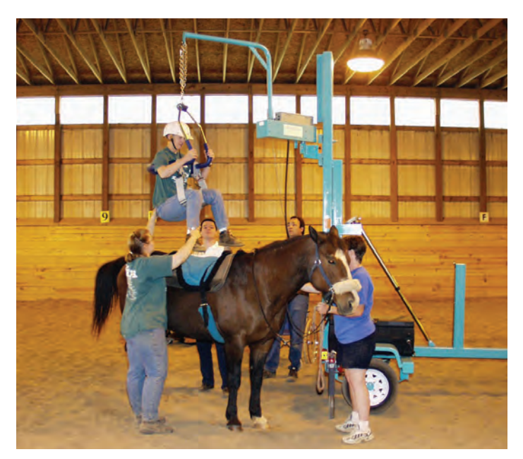
Figure 3. Sling lift used to assist user for horseback riding.

An electric powered vertical sling lift could be mounted (a) on a mast on the exterior of the operator platform; (b) on a telescoping beam on the interior of the platform or cab; (c) on a roller track on an overhead beam in the machinery shed, which would allow the user to be lowered into the operator seat from above; (d) to a parallel linkage fixture mounted to the floor of a building; or (e) to a mobile unit, such as trailer, RV, horse trailer, or truck.