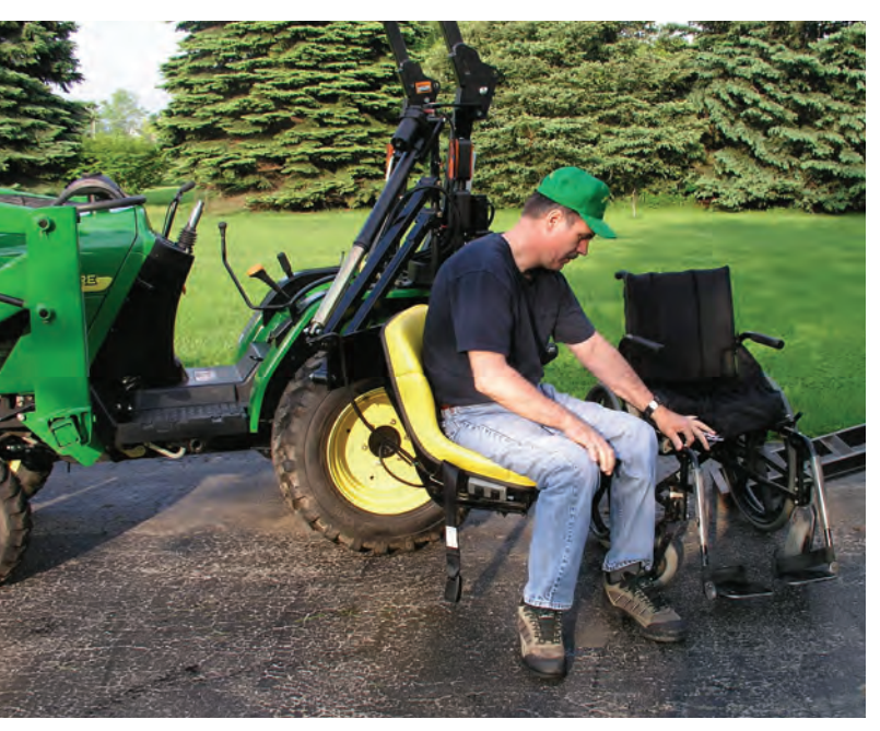
Figure 2. Lift seat doubles as operator seat of tractor, eliminating the need for a second transfer.