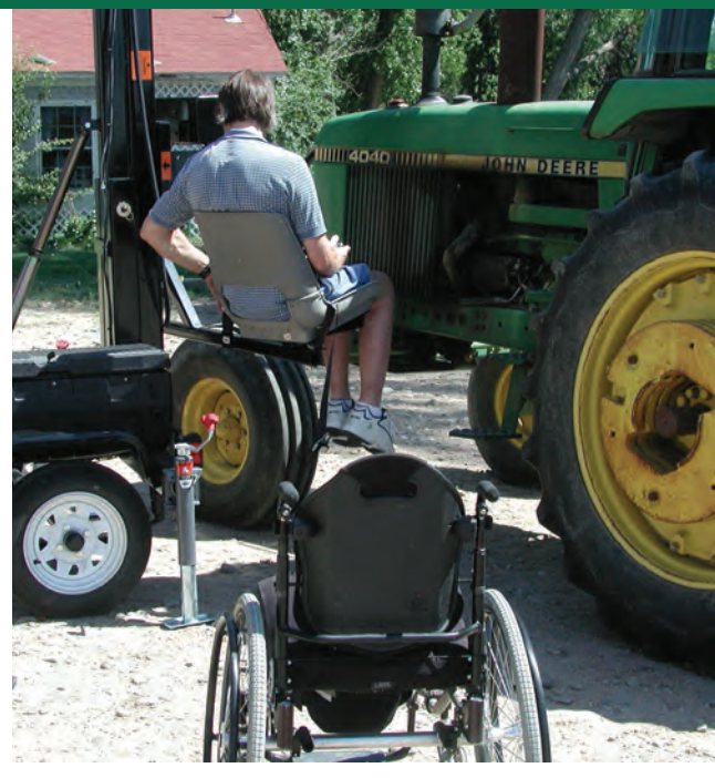
Figure 8. Trailer mounted independent lift.

custom farming and helping neighbors while using their equipment, (3) if they operator has a short-term disability, such as a broken leg, and (4) in cases where a dedicated access lift would interfere with a particular operation or be highly susceptible to damage (e.g., logging). The operating range of the trailer-mounted access lift is approximately 9<sup>1</sup>/<sub>2</sub> feet vertically and 8 feet horizontally. One concern raised with these lifts is the height that they can operate in order