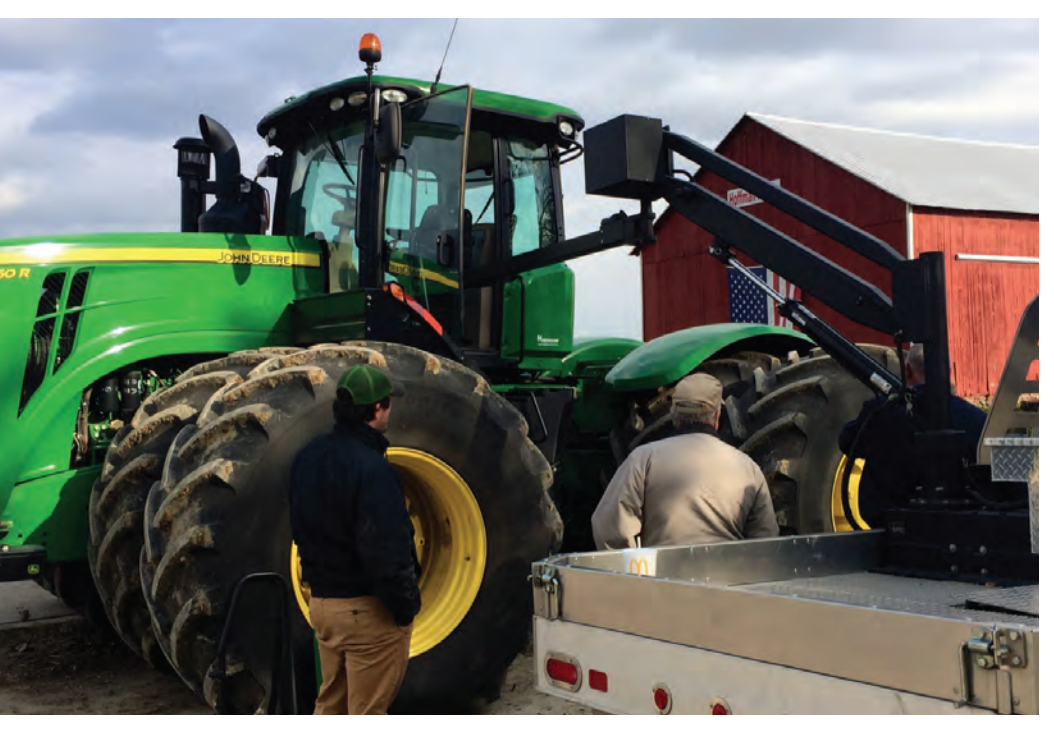
Figure 9. Independent access lift allows user to access locations up to 12 ft. up and 14 ft. away from the host vehicle.