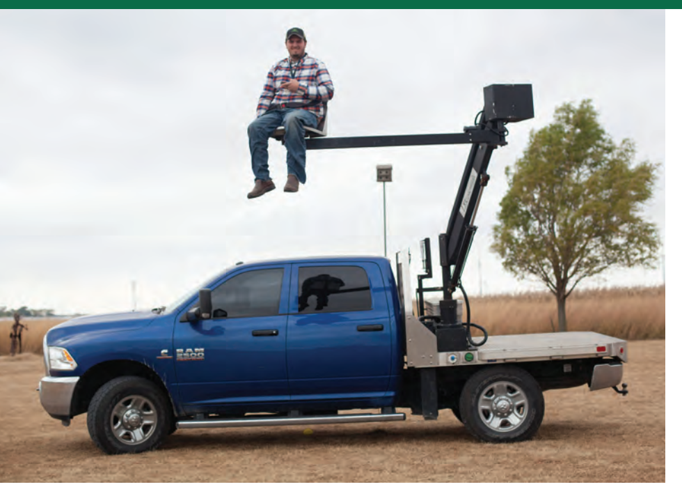
Figure 7: Pickup truck-mounted independent access lift.