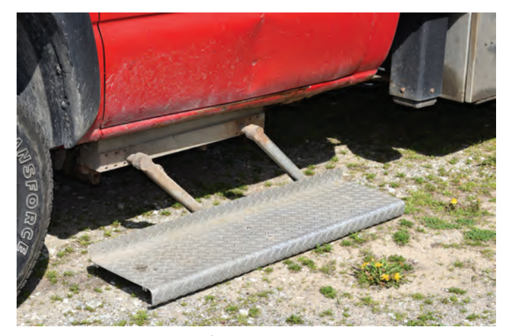
Figure 5. Running board lift to assist driver (and/or passenger) into vehicle.

A dedicated-machine access lift is mounted directly on and used to access just one piece of equipment (Figures 1, 2, 4, 5, 6). It's commonly found in either a chair or a platform configuration attached to a vertical mast and