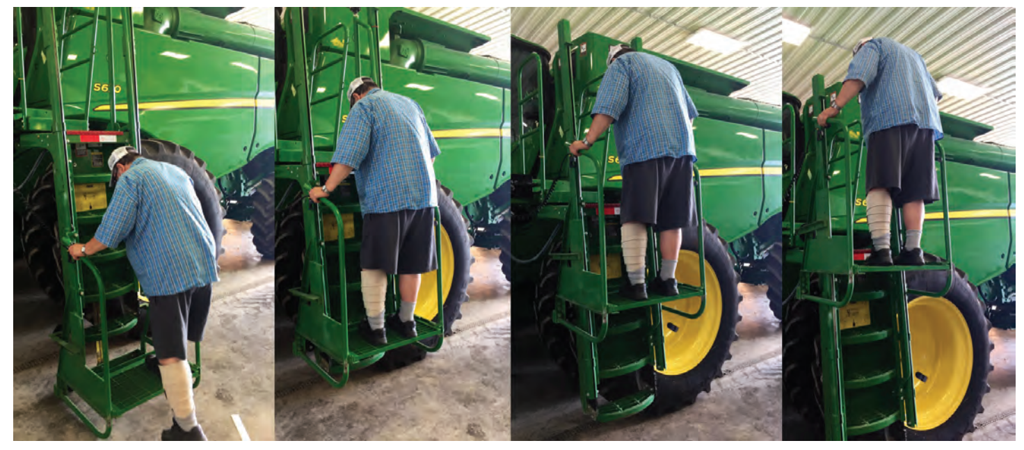
Figure 4. Platform lift with fold-away platform allows easy entry for both users in need of assistance and able-bodied users.

Another form of this access lift style can be found on a vehicle (truck, bus, semi-tractor, RV, etc., with a powered running-board that can be lowered to ground level. This and allows the user to stand on the running-board platform and be raised to the appropriate entry height (Figure 5).