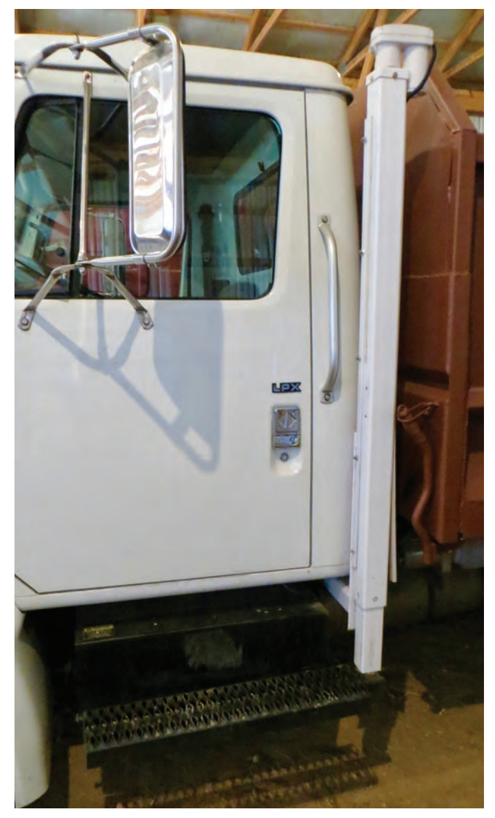
Figure 13. Ball-screw drive sideboard access lift mounted on a grain truck.

demands and offered the fail-safe benefit of preventing freefall if a malfunction occurred (Figure 13). However, with the ball-screw, issues developed relative to collected residue on the drive components, and the speed of operation was slower than users desired. Thus, ball-screw access lifts were (and still are) typically limited to light-duty designs.