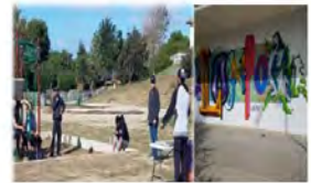
Community Outreach Programs Community Outreach Programs for organizations and at-risk youth, developmental programs & immersive event services.