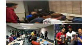
iAM STEAM Academy: Youth Science - Tech - Art Program Wrap-around immersive science, technology, engineering, art, and math (S.T.E.A.M) programs iAM STEAM Academy