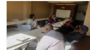
SEED-TO-STORE Our "Seed-to-Store" program brings industry experts in Industrial EMP, and Agriculture Direct Supplier programs to you virtually and in person. Connecting you, so your new or existing farm is a success.