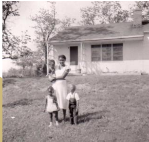
3 rd Generation Sam & Cleo Owned the Farm From 1949 to 2001 Raised and Educated 5 Children, All 5 Attended College