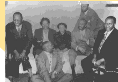
6 out of 7 Graduated From College During the 30's and 40's