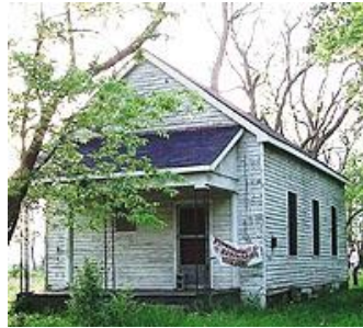
Secured $1,200 Loan from Union Benevolent Society