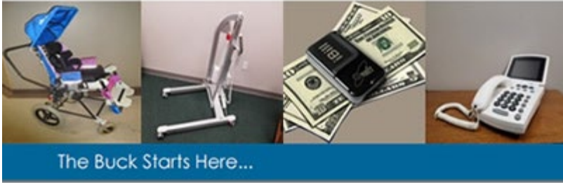
A Guide To Assistive Technology Funding In Kentucky