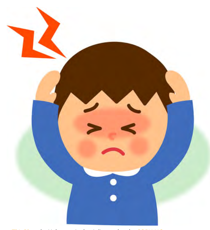
This Photo by Unknown Author is licensed under <a href="CC BY-NC">CC BY-NC</a>