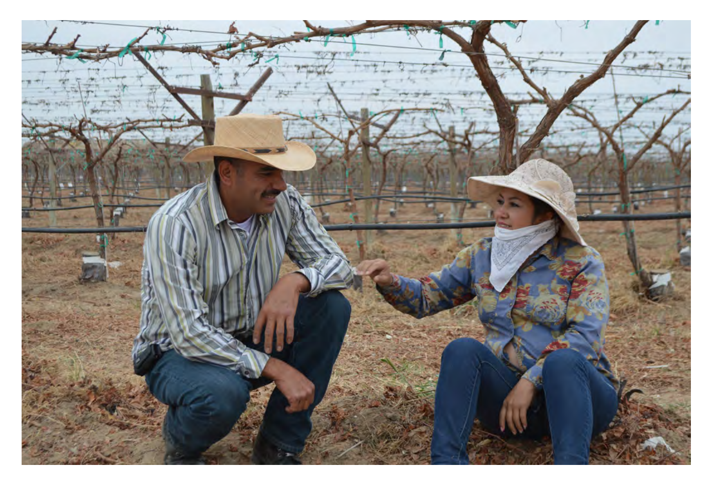
Symptoms of Mental Health or Stress Problems