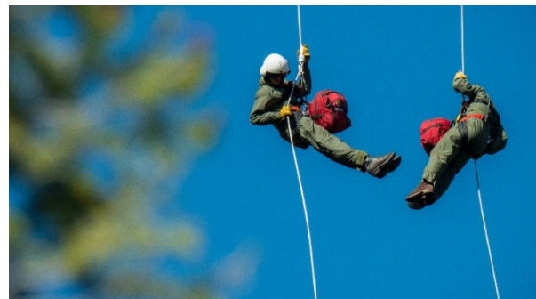
Veterans can learn to fight wildfires through the USDA Forest Service's apprenticeship