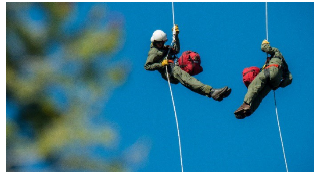
Veterans can learn to fight wildfires through the USDA Forest Service's apprenticeship